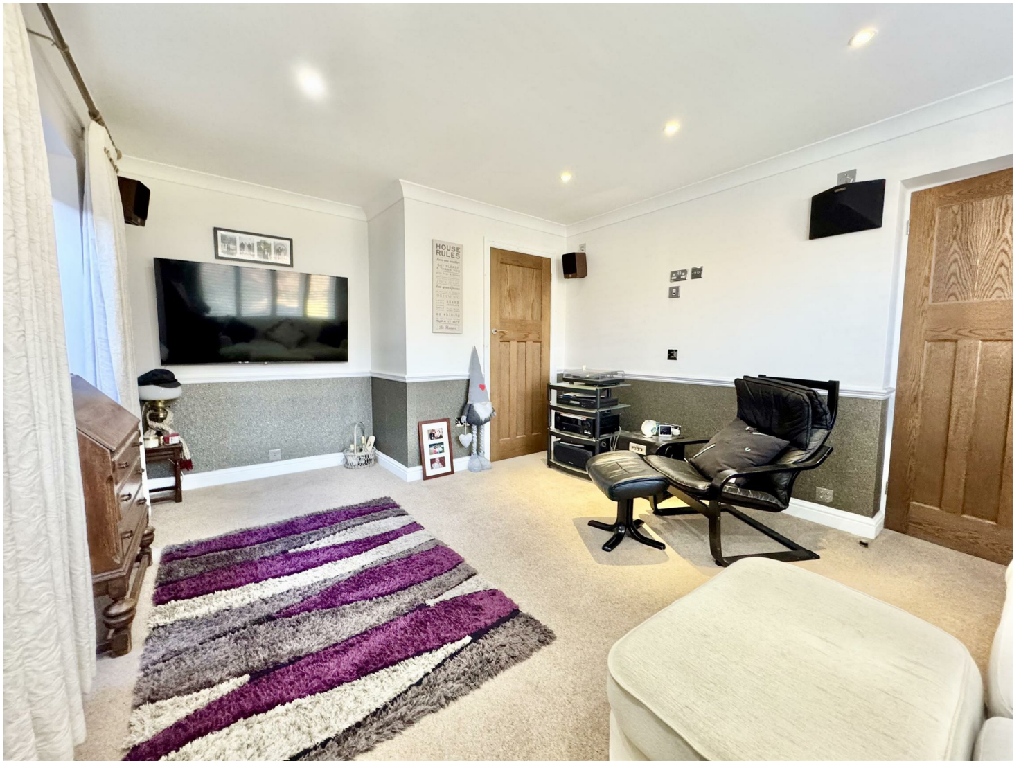
LOUNGE 13'3" max into bay x 11'11" apx.